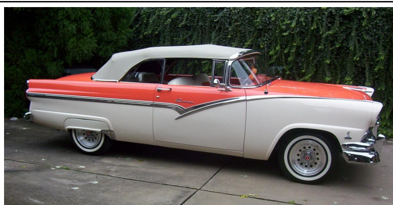
Charlie Cooper's recently purchased 1956 Ford Crown Victory

There were also technical articles of great interest. My favorites were one on tightening up loose wood-spoke wheels, and another on the old varnish based paints used on cars during the teens. For those who don't know, these paints were thin as water, and were applied by splash or even a water hose-type nozzle. The excess paint would run