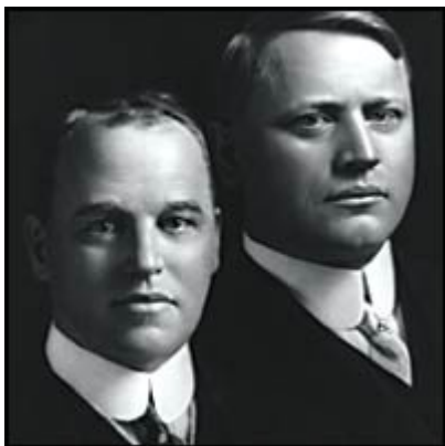
John (right) and Horace Dodge

The Dodge brothers were approached by Henry Ford in 1902 with his plans for a new automobile and contracted with him to become the exclusive supplier of 650 chassis. The brothers agreed to produce almost the entire chassis (engines, transmissions and axles mounted on frames — everything but the body, wheels and tires). When Ford, who was initially short on cash, couldn't make a $5,000 payment, he offered the brothers 50 shares of Ford stock worth $10,000, making them 10-percent stockholders in the new Ford Motor Company.