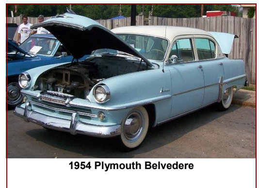
1954 Plymouth Belvedere

At about 11:00 p.m. last Saturday night, I found myself taking my granddaughter and her new husband from the new Robert Trent Jones clubhouse to the Marriott hotel---in the '54 Plymouth. It worked fine; no problems at all. And all the lights worked, even though I hadn't driven it at night for years. It isn't a classic car as someone wanted, but there sure were a lot of pictures taken with the couple in the backseat.