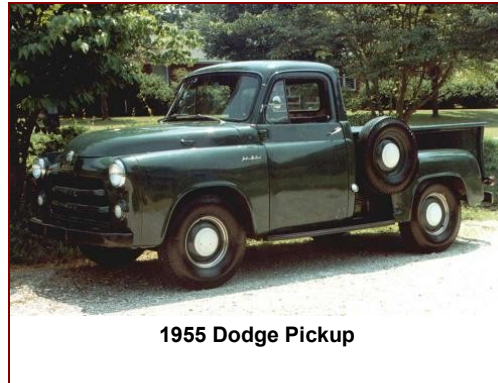
1955 Dodge Pickup

The movie "When I Find The Ocean" opened August 10 in Montgomery, Alabama. The film was produced by Cypress Moon Productions from Sheffield, Alabama, where the initial premier was held in 2006.