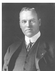
Horace E. Dodge