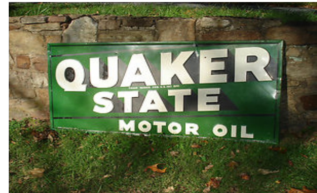
A Quaker State metal promo sign

That little company, Quaker State established in 1859 has come a long way!!